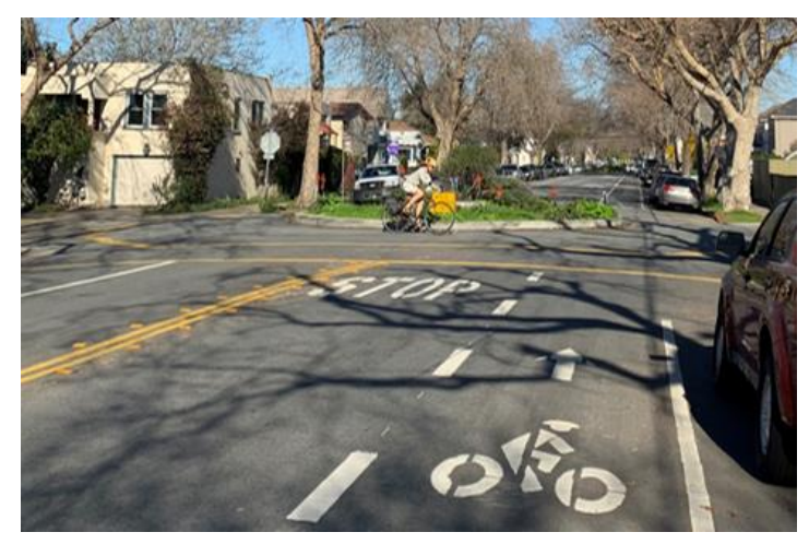
Existing bike boulevard route showing roundabout and crossing treatment.