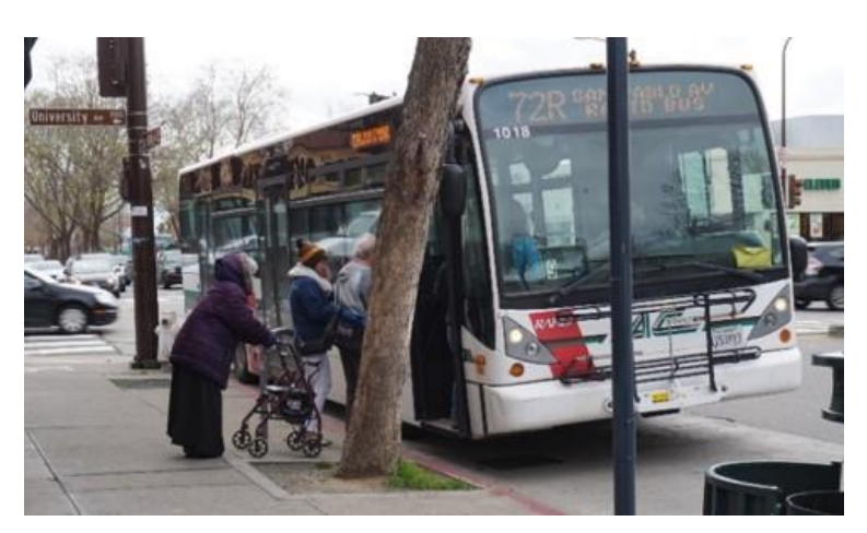
Current AC Transit Rapid Bus along San Pablo Avenue.