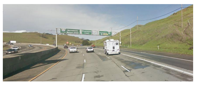
I-680 northbound approaching the SR-84 off-ramp in Sunol.