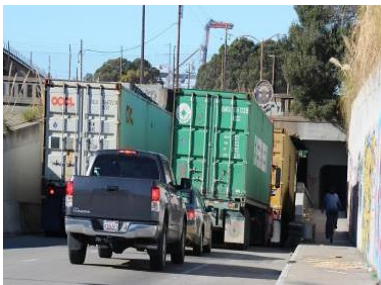
Truck stuck at the 7th Street underpass.