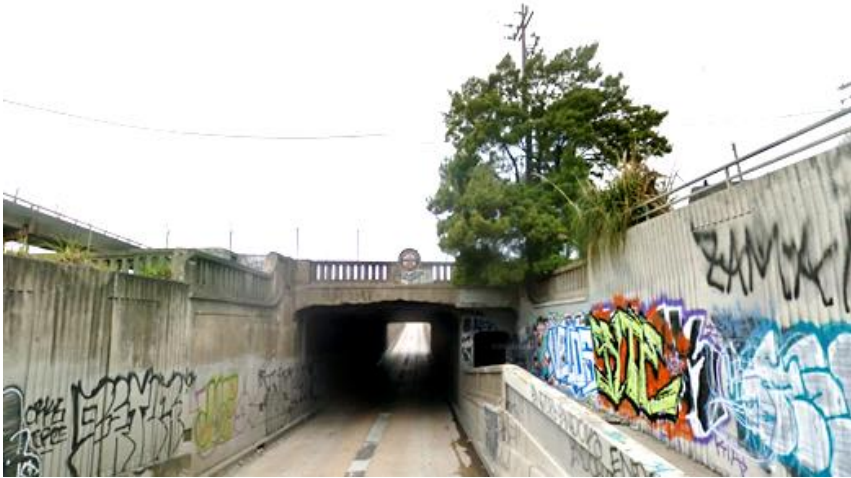
7th Street, approaching Union Pacific Railroad bridge from the east.