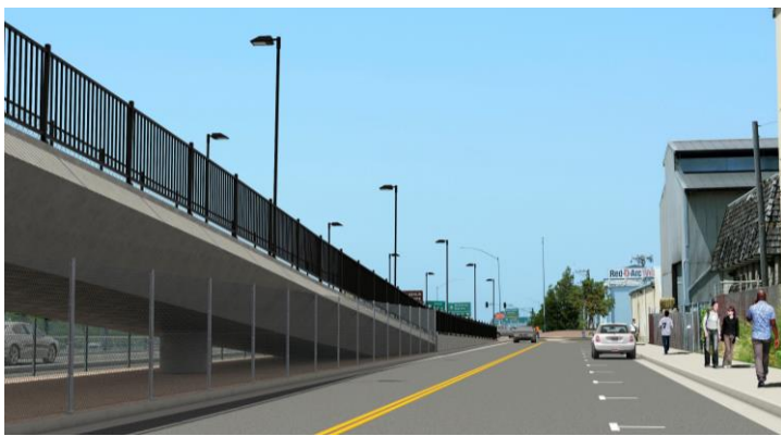
Conceptual rendering of the I-80 Gilman Interchange Improvements project looking north along Eastshore Highway before Gilman Street.