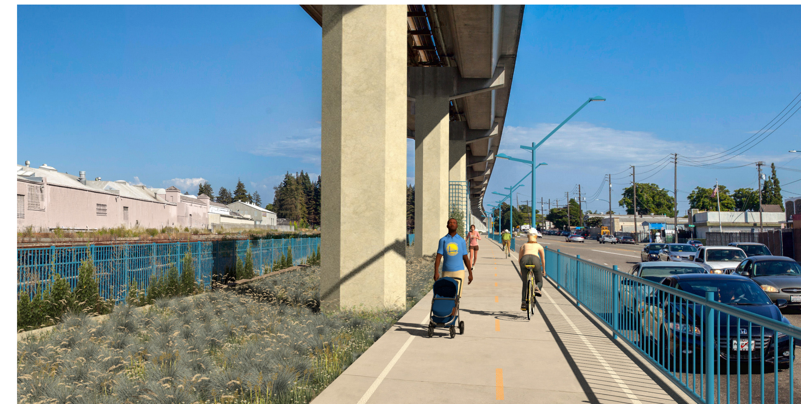
East Bay Greenway simulated image

Phase 2: The Urban Trail Project is the long-term plan and will provide an off-street trail with linear, park-style enhancements, but requires right-of-way acquisition from Union Pacific Railroad.