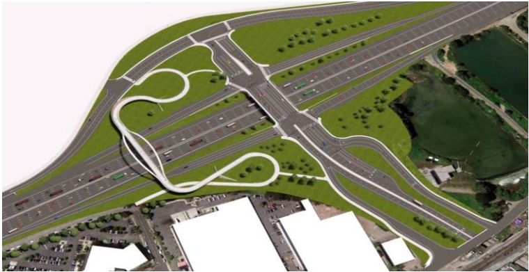
Aerial view rendering of the separated bicycle and pedestrian bridge at the I-80/Ashby Avenue (SR-13) interchange.