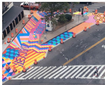
Improved Streetscape: NYC

Bikeway with green stormwater infrastructure buffer