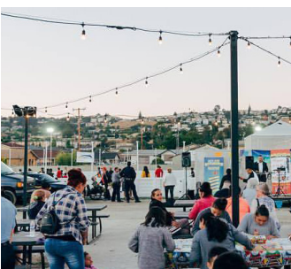
Eden Night Live: Ashland

Opportunities to create more public space at oversized or skewed intersections