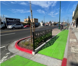
Protected Bikeway: Ashland

Bikeway with green stormwater infrastructure buffer