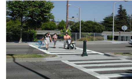
Pedestrians using ADA accessible crosswalk (Phil Erickson, DC+A)