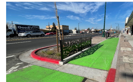
Protected bikeway with green stormwater infrastructure buffer (Phil Erickson, CD+A)