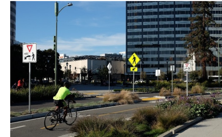
Landscaped protected bikeway in Oakland (Derek Magee, CD+A)