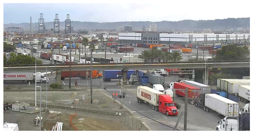
Congestion in the 7th Street/Maritime vicinity.