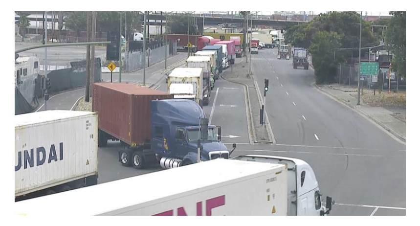
Truck queues looking south along Maritime Street towards the 7th Street/Maritime Street intersection.