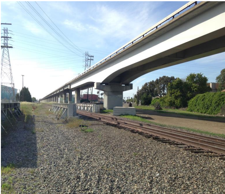
Project corridor in San Leandro south shared by UPRR – an active freight rail line.