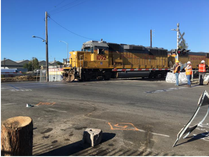
Rail crossing along 37th Avenue in the City of Oakland.