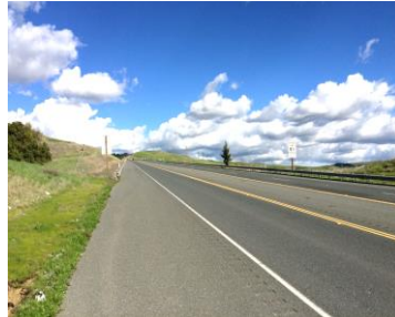
SR-84 looking westbound near Ruby Hill Road.