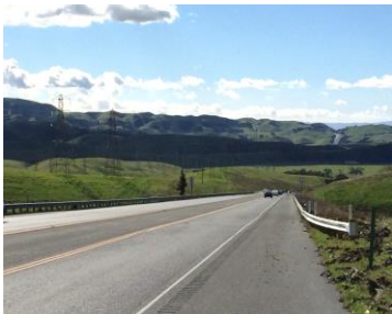
SR-84 looking eastbound near Ruby Hill Road.