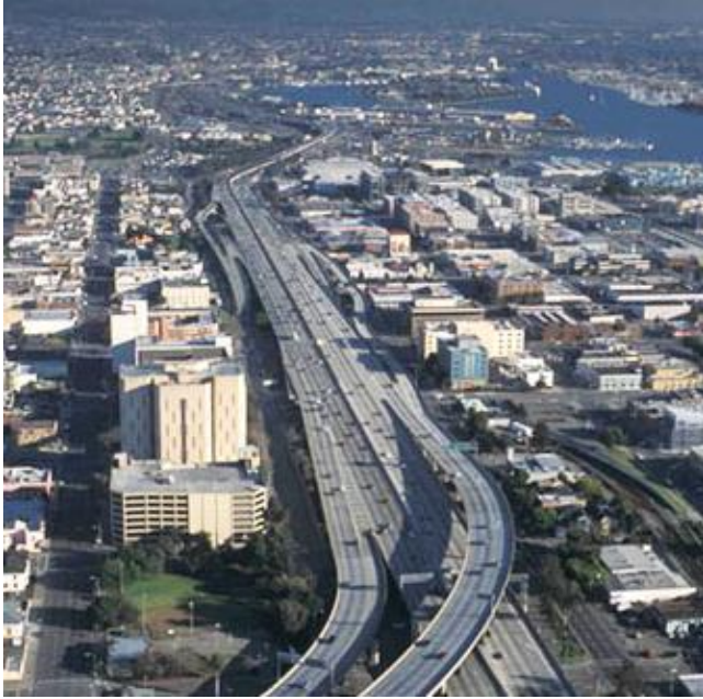
Aerial view of Oakland Alameda Access Project.