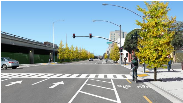
Rendering of 6th and Webster Streets