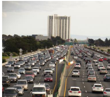
I-80 freeway looking south approaching the Ashby Avenue exit.