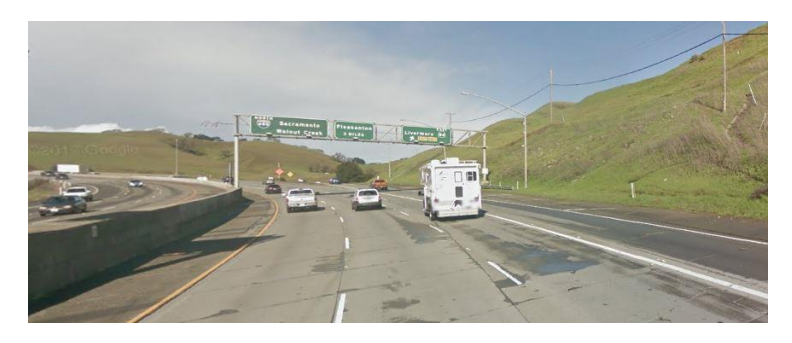
I-680 northbound approaching the SR-84 off-ramp in Sunol.