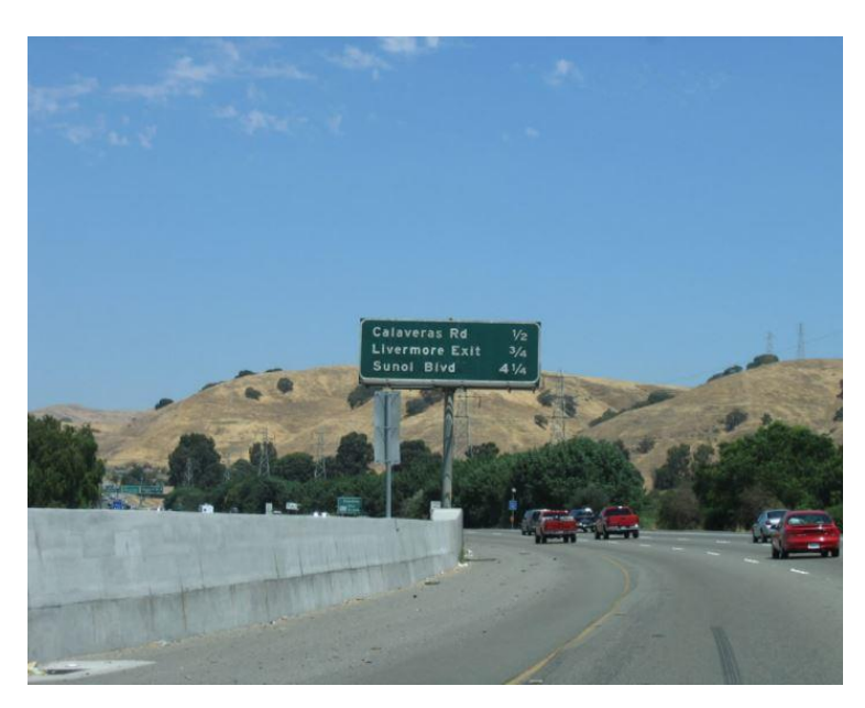
I-680 northbound approaching the Calaveras Road off-ramp.