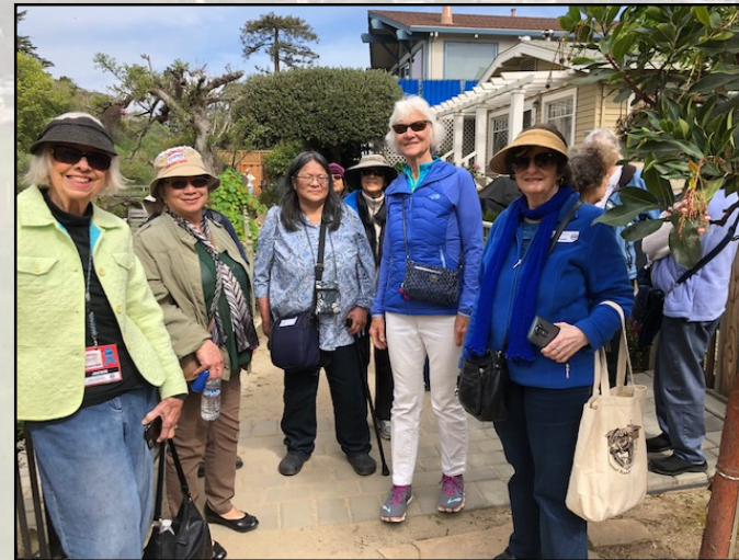
Day Trip to Capitola