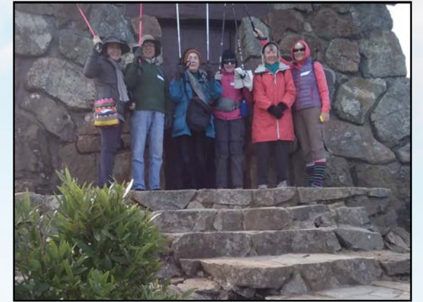
Hike to Mt. Diablo

Group Trips - Albany residents who are 50 or older.