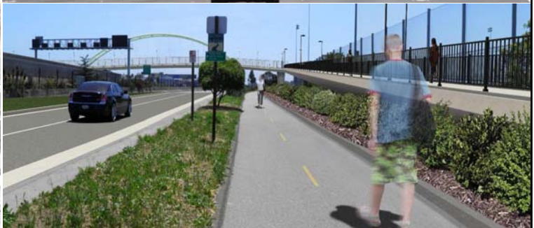
Visual simulation from Bay Trail southwest of Gilman Street.