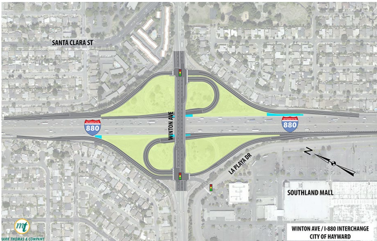
Preliminary interchange geometric at the I-880/Winton Avenue interchange.