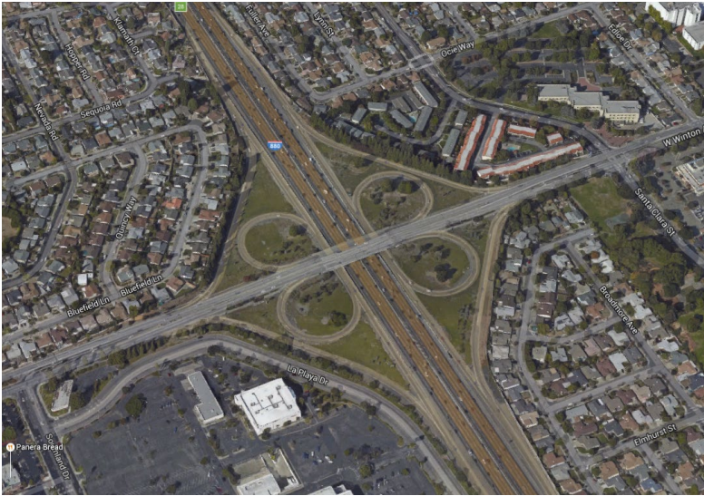
Current interchange at I-880/Winton Avenue.