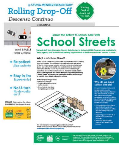
Photo courtesy of SR2S School Circulation Diagram, September 2020