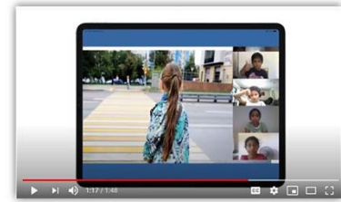
Photo courtesy of SR2S, Virtual Pedestrian Safety Training for Elementary School, September 2020