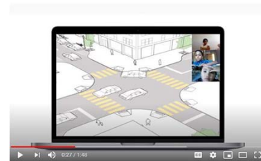
Photo courtesy of SR2S Virtual Pedestrian Safety Training, September 2020

Music Notes has created a custom walking and biking-themed virtual school assembly that teaches walking and biking safety through live and interactive rap songs and videos