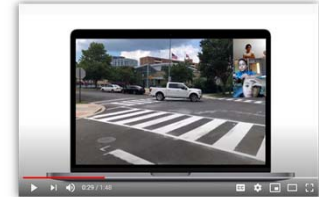
Photo courtesy of SR2S Virtual Pedestrian Safety Training for Elementary School, September 2020

School assemblies are virtual interactive learning experiences