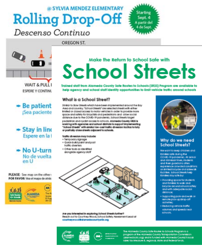
September 2020