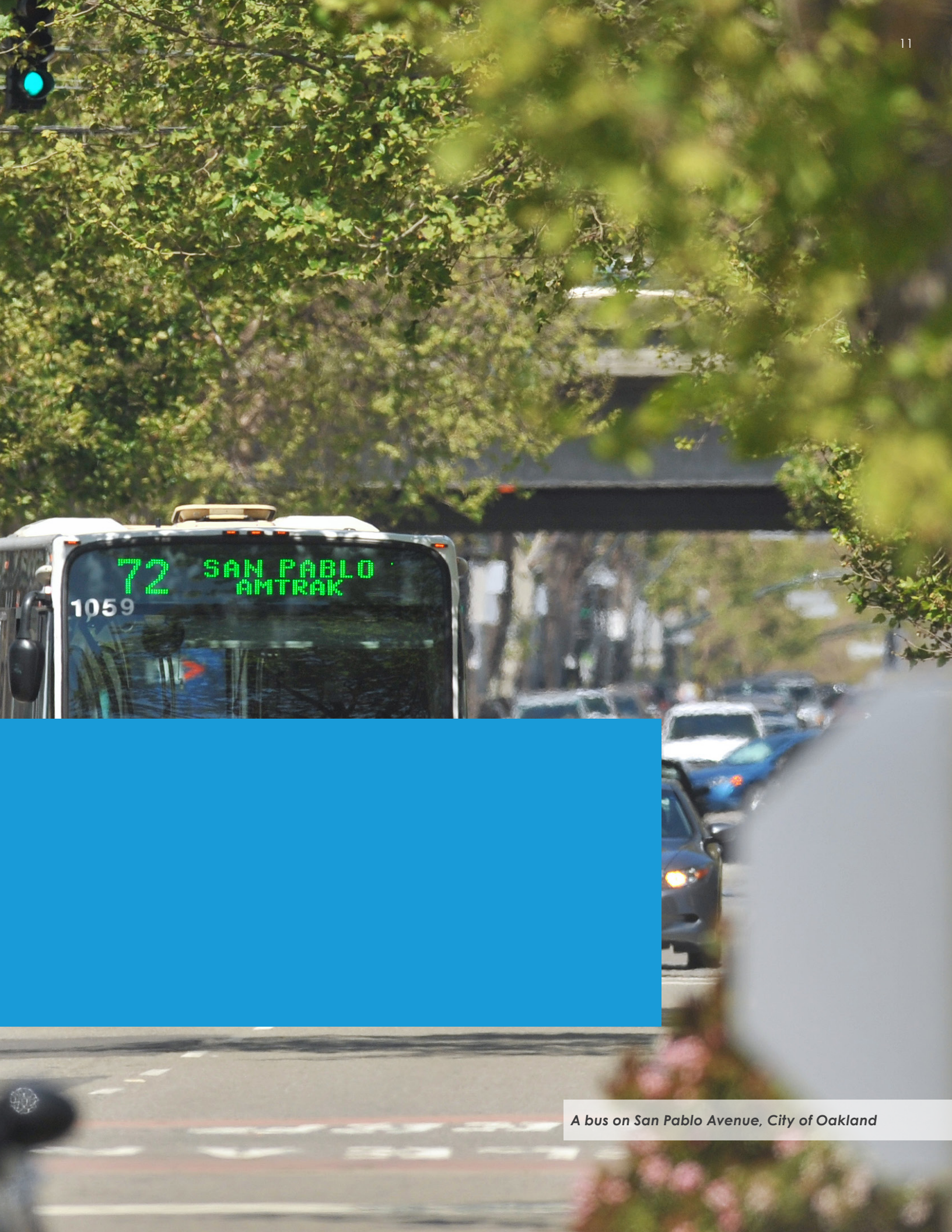
A bus on San Pablo Avenue, City of Oakland