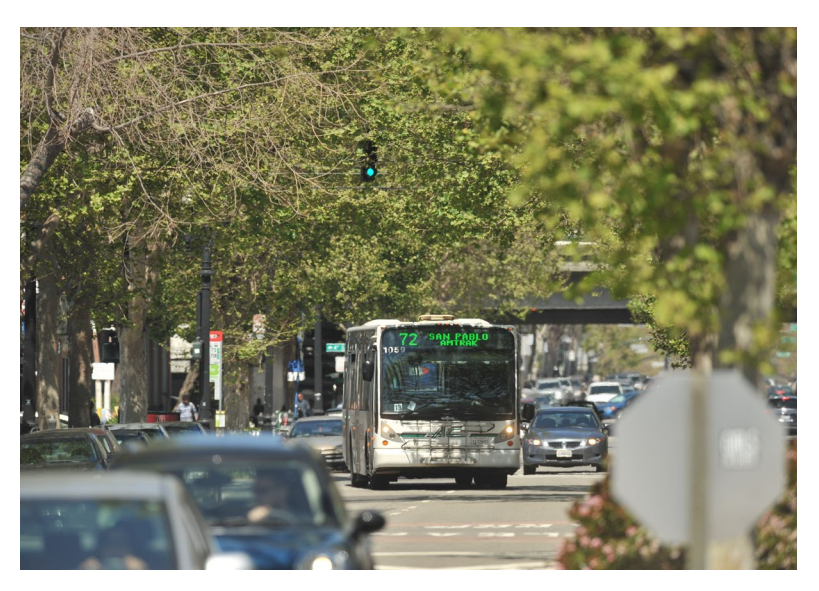
Alameda-Contra Costa Transit District bus traveling on San Pablo Avenue.