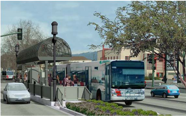
Rendering of East Bay Bus Rapid Transit at 98th Street in Oakland by FMG Architects.