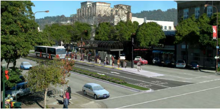
Rendering of East Bay Bus Rapid Transit in Berkeley.