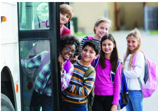
Students boarding a bus in Alameda County.

"I was able to get a job, because I have a Clipper card ..."