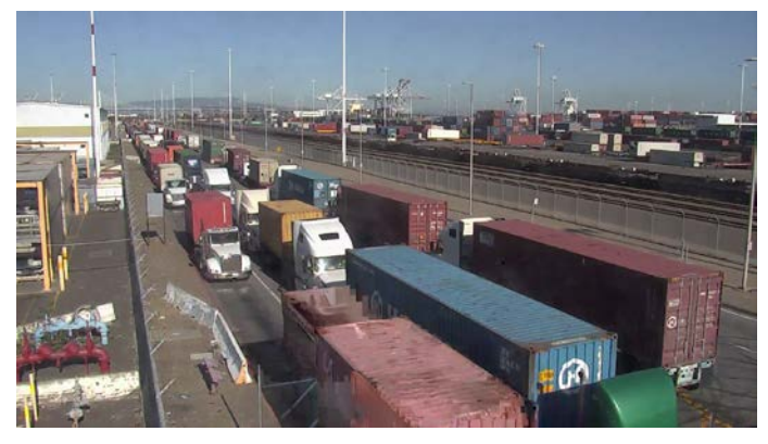
Congestion, bottlenecks, and trucks queuing at the Port of Oakland.