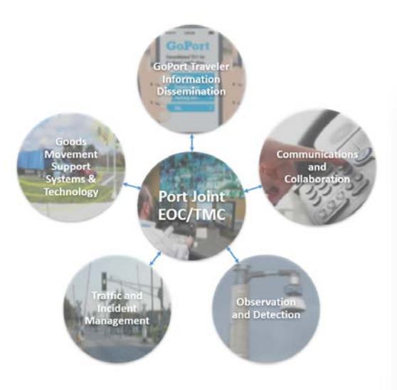
Freight ITS operations overview.