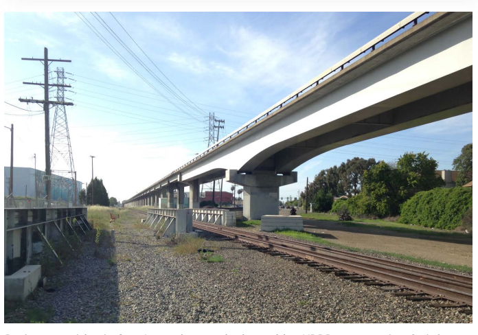
Project corridor in San Leandro south shared by UPRR – an active freight rail line.