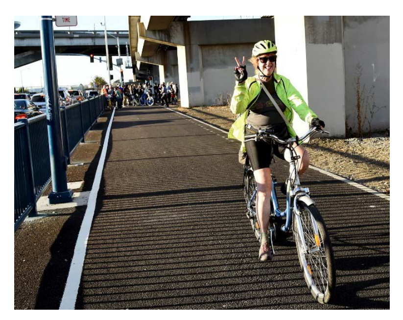
Initial East Bay Greenway segment from Coliseum BART to 85th Avenue (funded by Measure WW, TIGER and BAAQMD).