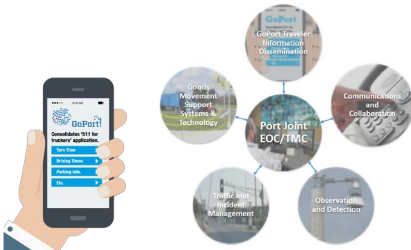
GoPort mobile application.