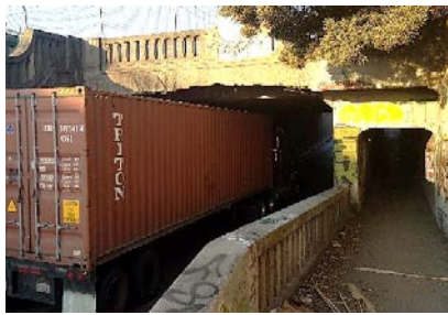
Existing multi-use path and damage to the 7th Street underpass.