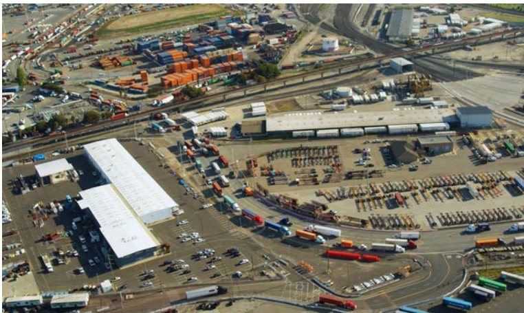
Aerial view of the Port of Oakland, March 2016.