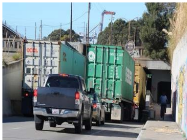
Truck stuck at the 7th Street underpass.