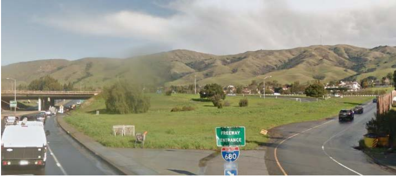
Eastbound SR-262 at the I-680 southbound on-ramp.