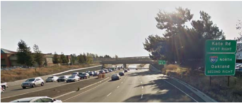
Westbound congestion along SR-262 during the afternoon commute.