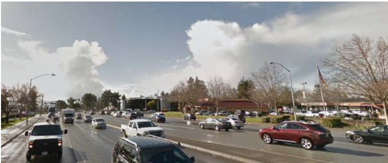
Westbound and eastbound traffic on SR-262 in Fremont.