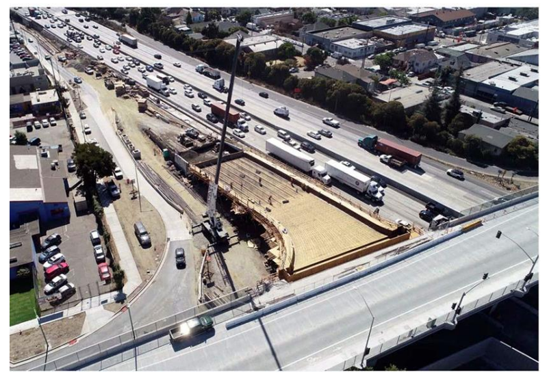
29th Avenue off-ramp under construction, courtesy of Caltrans.