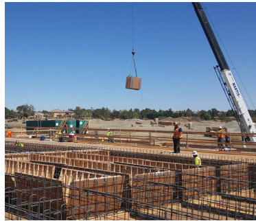
Construction of bridge widening at Arroyo Del Valle.