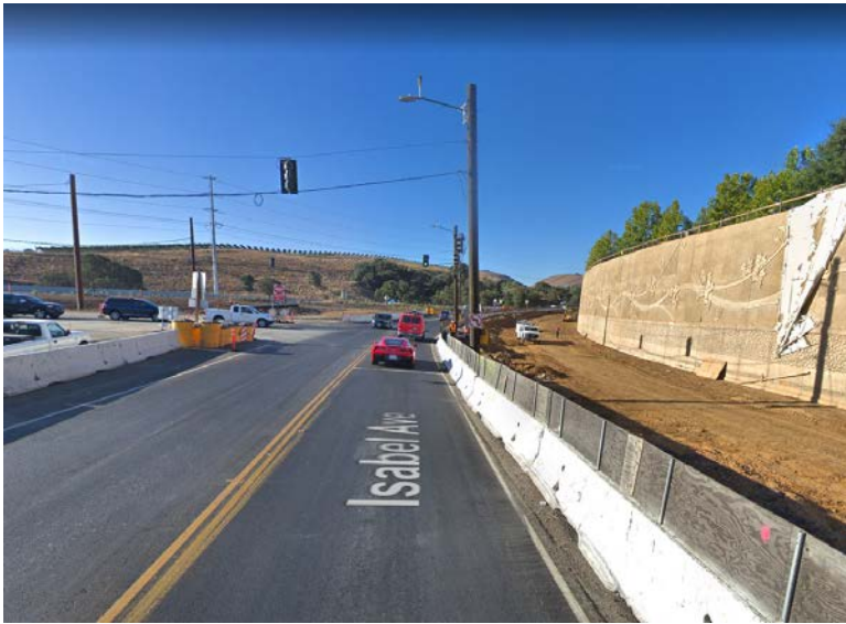
Southbound on Isabel Avenue at Vallecitos Road.