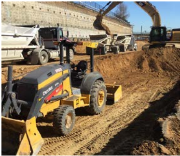
SR-84 Expressway – South Segment.