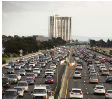
I-80 freeway looking south approaching the Ashby Avenue exit.