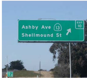
I-80 eastbound Eastshore Freeway approach at the Ashby Avenue exit.