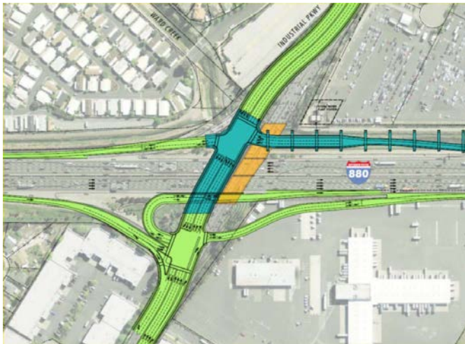
Renderings of the project areas for the Feasibility Study.