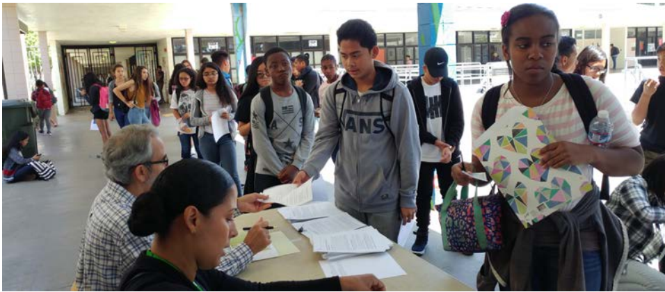
Students registering for the STPP program in August 2016.