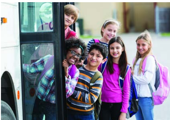
Students boarding a bus in Alameda County.

"I was able to get a job, because I have a Clipper card ..."