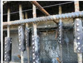
Retaining wall rebar detail