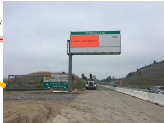
Overhead Express Lane sign structure