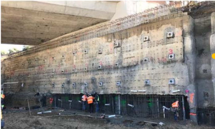
Soil nail retaining wall structure at Palm Avenue