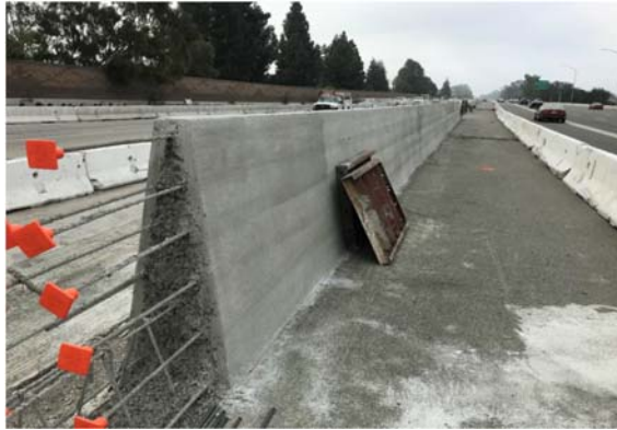
Concrete barrier construction