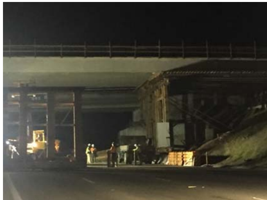
Full freeway closure for falsework removal operations