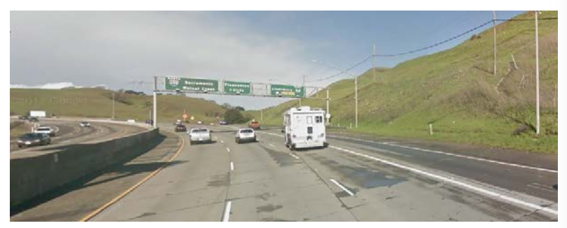
I-680 northbound approaching the SR-84 off-ramp in Sunol.