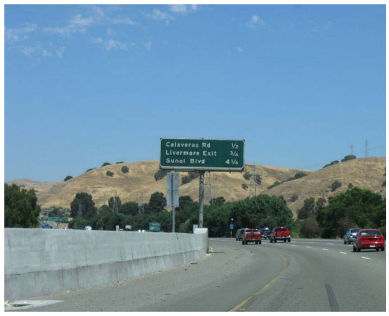
I-680 northbound approaching the Calaveras Road off-ramp.