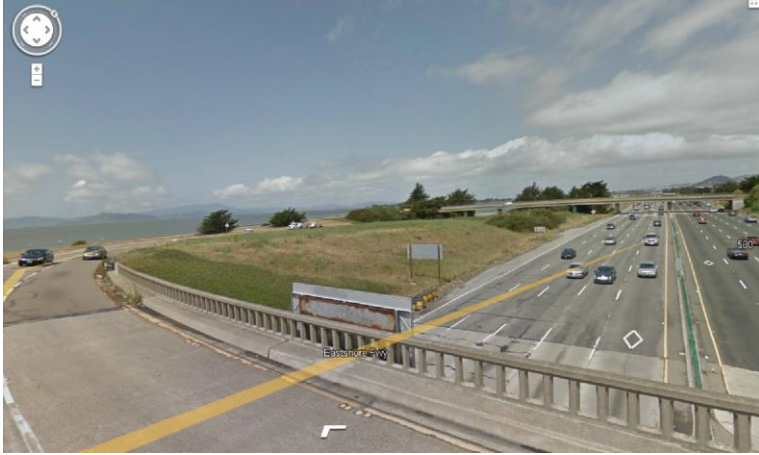
I-80/Ashby Avenue interchange from Google Maps.