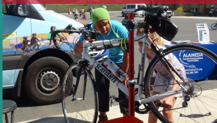
BikeMobile at Green Elementary School in Dublin, CA

A pilot program managed under the Alameda CTC's Safe Routes to Schools program, the BikeMobile hosts Bike Fix-a-thons — where bicycle mechanics teach youth mechanics and safety and how to repair their bikes — at schools, community centers, parks and community events across Alameda County.