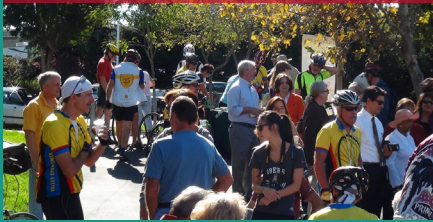
Alamo Canal Ribbon Cutting

Alameda CTC hosted or participated in the following events in November and will participate in one event in December: