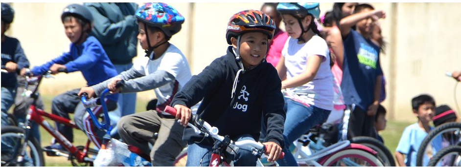
Thousand of students biked to school on Bike to School Day, May 11, 2017.