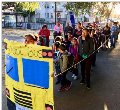
Students walk together in a Walking School Bus at Achieve Academy in Oakland, Calif.