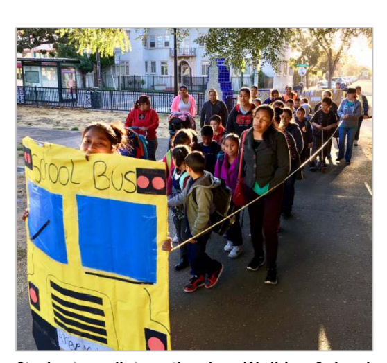
Students walk together in a Walking School Bus at Achieve Academy in Oakland, Calif.