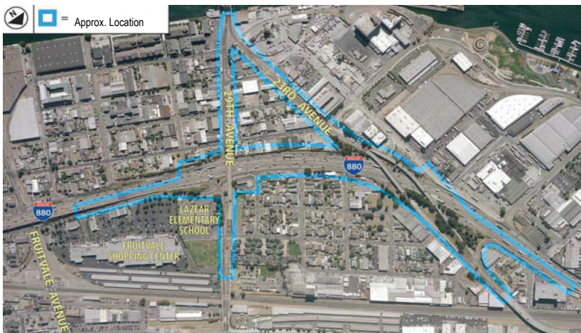
Top Left: Current I-880 northbound on-ramp near 23rd Avenue in Oakland, CA. Top Right: Aerial of approximate project location. Note: The information on this fact sheet is subject to periodic updates.