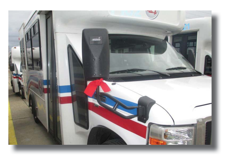
A TARC3 paratransit van in Louisville, Kentucky with a red ribbon on the right side mirror for the Make the Right Choice campaign.

ESPA publishes Update quarterly on special topics of interest. Sign up to receive Update through ESPA's Extra e-newsletter at www.projectaction.org ,