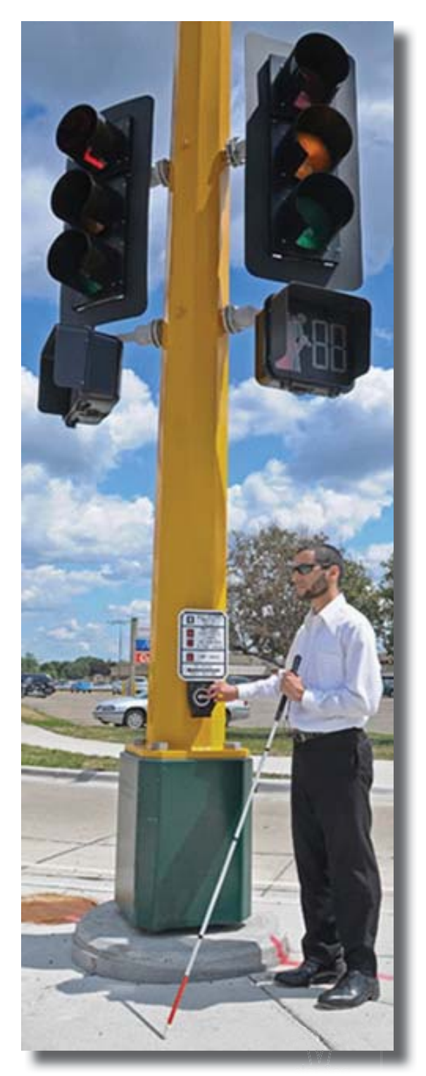
An APS in Minnesota