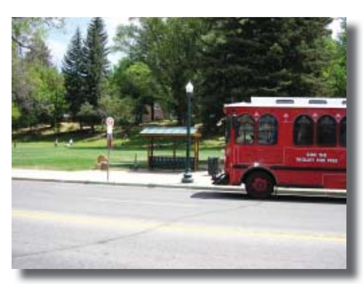
A Durango Transit trolley in Durango, Colorado

In 2011, the coordinating council participated in ESPA's Accessible Transportation Coalitions Initiative with a goal to provide driver trainings in the region and ultimately initiate volunteer driver programs. In August, Montezuma Transit, a member