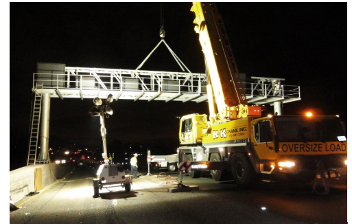
I-80 SMART Corridor Gantry Installation in Berkeley and Emeryville