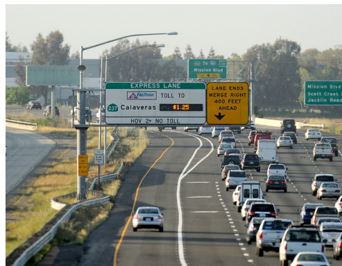
I-680 Express Lane

In 2010, the southbound I-680 Express Lane launched a new era of congestion relief for solo drivers in Northern California, giving them the choice to pay a toll for access into the high occupancy vehicle (HOV) lane, when there is excess capacity. Carpool lane users continue to enjoy the convenience of sharing rides at no cost.