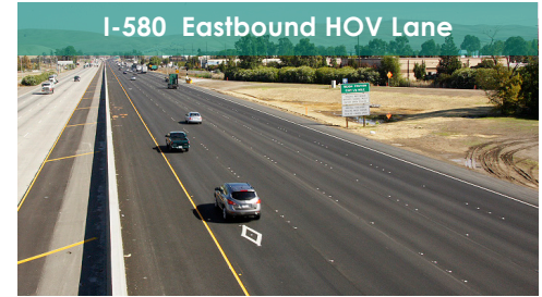
Transportation Planning cont'd on page 4

Long-term trend analysis shows that when the unemployment rate goes down, speeds on freeways go down (congestion increases); however, arterial speeds do not change. Further, speeds on the CMP network have been stable despite a considerable increase in vehicle miles traveled over the last 15 years, likely due to the various congestion management planning activities and implementation of projects undertaken in the county. The LOS Monitoring Report is now available on the agency's website.