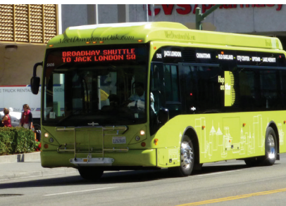
The free Broadway Shuttle gets people out of their cars and onto public transit, reducing automobile miles traveled by 3.3 million miles each year.