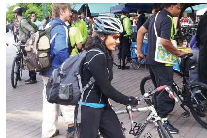
As part of Bike to Work Day, thousands of people throughout Alameda County participated in this event that supports active transportation and healthy lifestyles.