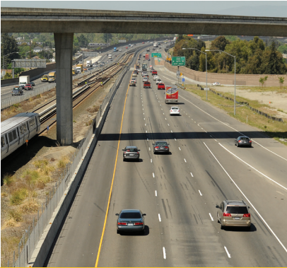
The I-238 Widening Project was completed in 2009 and continues to provide traffic relief in Central Alameda County on this major freight corridor.