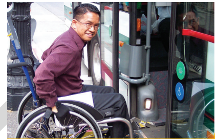
Measure B funds transportation programs for seniors and people with disabilities, such as volunteer escort and driver programs that provide access to community organizations, shopping and medical appointments.