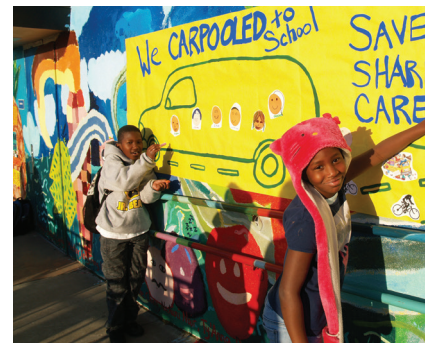
More than 100 schools participate in the Safe Routes to Schools Program that supports safe, healthy access to school by walking, biking and carpooling.