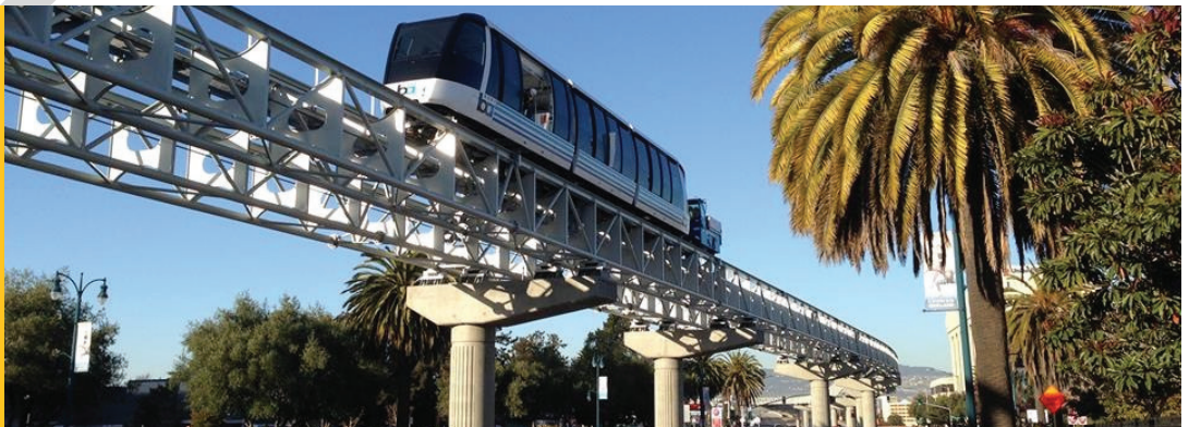
The BART Oakland Airport Connector Project will be in service beginning November 2014, providing a convenient transit connection from BART to the Oakland International Airport.

ALAMEDA CTC ALLOCATES 40 PERCENT OF MEASURE B FUNDS to capital projects, net of administrative funding. In FY12-13, Alameda CTC expended $60.6 million on capital projects for transportation infrastructure improvements, such as BART rail extensions, highway and transit improvements, local street and road enhancements, intermodal projects and other local projects.