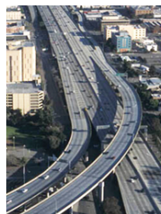
I-880 is a major goods movement corridor

Measure BB dollars funded the opening of BART's Warm Springs station in Fremont, which brings BART commuters 5.4 miles closer to Silicon Valley. Also, AC Transit East Bay Bus Rapid Transit (BRT) construction is underway to provide more reliable and faster travel along heavily traveled transit corridors in Oakland and San Leandro.