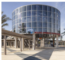
Warm Springs/South Fremont BART Station opened spring 2017

Here are just a few of the promises we are delivering with Measure BB funds.