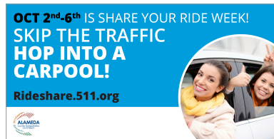
Share Your Ride Week education October 2017

This fall, we launched the second year of a three-year pilot Student Transit Pass Program in cooperation with 15 schools in Alameda County reaching 17,000 students. In June 2017, we completed a paratransit needs assessment to address affordability, access, ride performance and other needs of seniors and people with disabilities.