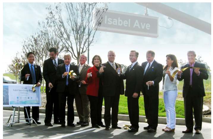
Left: Aerial view of newly constructed Rte 84/ I-580 Isabel Interchange in Livermore, CA. Right: Ribbon Cutting Ceremony held March 30, 2012 to celebrate completion of the project.

Note: The information on this fact sheet is subject to periodic updates.