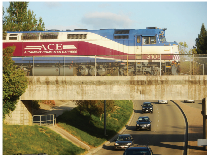
Altamont Commuter Express (ACE) Rail Train

Note: The information on this fact sheet is subject to periodic updates.